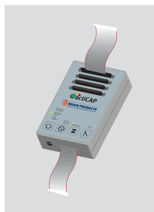
ControlBox Version I